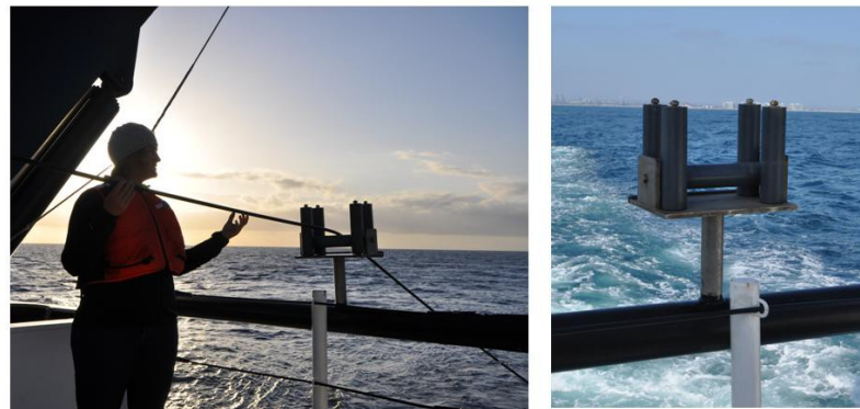
Figure 4. Roller to aid in deployment/retrieval of array from aft deck. Roller can be removed by lifting (requires 2 people).

Deployment and Retrieval of Towed Arrays: Two acousticians are required to deploy the towed arrays: one to run the winch, the other to work with the cable. The winch/HPU worked well with the exception of the noted leak requiring maintenance. The speed of the winch was sufficient to deploy/retrieve in reasonable time (< 15 min). Ships' speed for retrieval should be no greater than 5 knots; while deployment was only tested at 5 knots, previous experience suggests that deployment speeds of up to 8 knots would be safe when needed. 'Jerking' of the winch was dampened, which allows for minimal training of personnel to run the winch (during the shakedown I showed someone how to run it in 30 seconds and felt safe enough to deploy with 1 experienced and 1 new person). The deck crew modified a roller to fit on the aft stanchion to facilitate deployment/retrieval (Fig. 4). This is the easiest and safest device we have used to date; however, the rollers do not meet the minimum bend radius of our tow cable. Ideally, we would like to modify the roller so that it meets the bend radius for our tow cable. When using a linear array, the entire array can be deployed/retrieved from this device (with the exception of the initial toss). The roller can be removed by lifting (very heavy, requires 2 people).