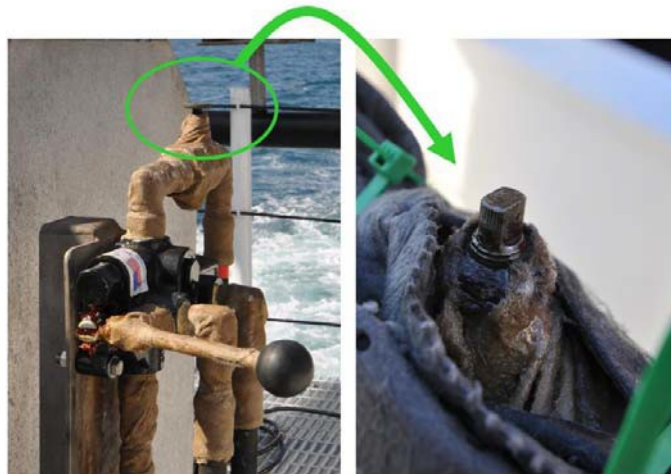
Figure 3. Photo of Winch Speed Adjuster (prior to failure) and close up of poor screw condition and leak.

Suggestions: If the hydraulic hoses are long enough, they should be run through the bulkhead hole (where the deck cable runs) and remain attached to the winch hoses for the entirety of the survey. The HPU should be repaired so that it does not seep hydraulic fluid when the screw is moved.