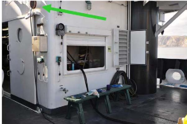
Figure 1b. Photo of HPU (with roll-up door behind it). The black button is the START, the red button is the STOP. The green arrow points to the pressure gauge. The red arrow points to the temperature gauge for the hydraulic fluid.