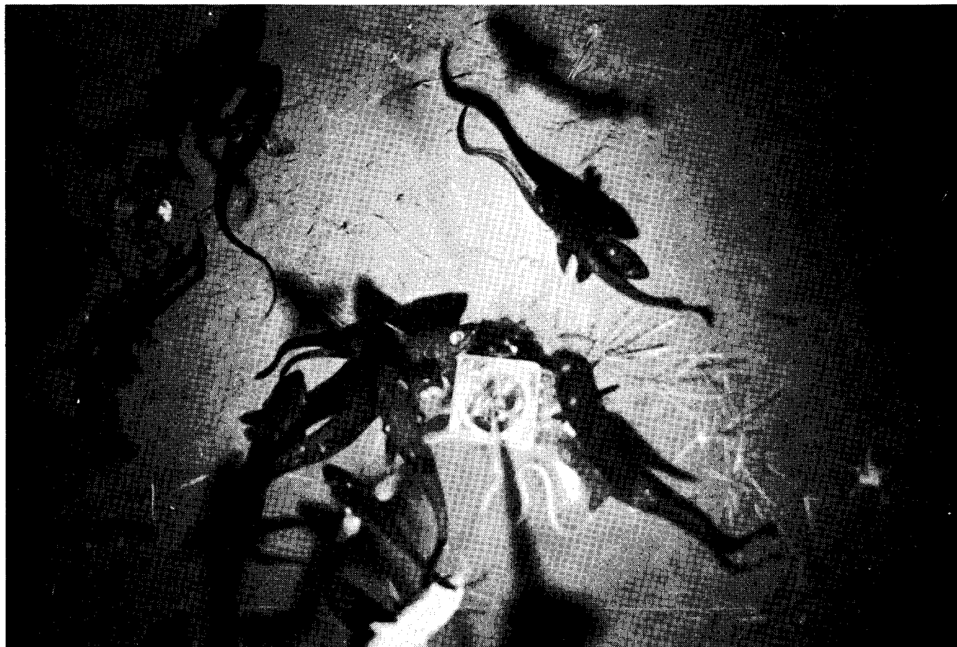
FIGURE 3. Grenadiers, hagfish, migrating tube worms and other creatures attracted to a bait and photographed by an untethered automatic camera at 1200 fathoms off Baja California.—(field view is about 9' x 12').

sources Laboratory in 1964, and in September of that year moved from the old, frame building on the Scripps campus, where it had been housed since 1954, to the newly built Fishery-Oceanography Center on a cliff site overlooking the ocean, \frac{1}{2} -mile north of the old location.