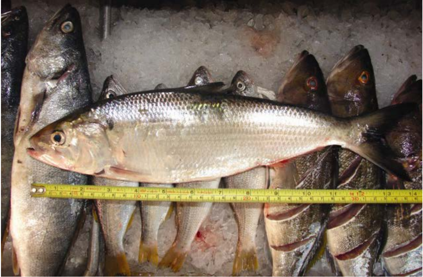
Figure 2. Individual of American shad, Alosa sapidissima , captured on June 28, 2012, at Bahía de Todos Santos, Baja California, México.

2011 ( < -0.5^{\circ}\text{C} ), with the lowest temperature anomaly at December ( -1.5^{\circ}\text{C} ), and weakened in April 2012 to -0.5^{\circ}\text{C} (NOAA 2013).