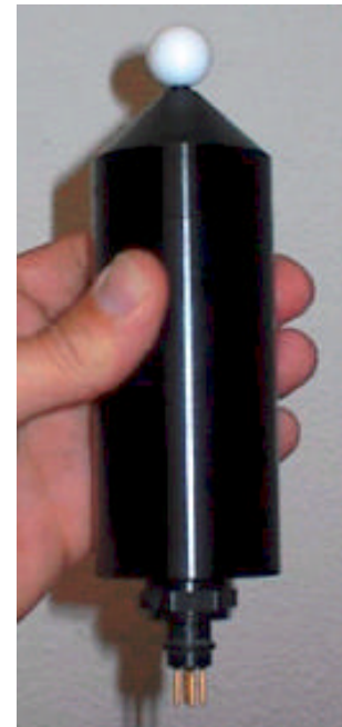
The new QSP-2000 is rugged and compact.

QSP-2300 and QSP-2350 , logarithmic-cpqr output versions are also available. This sensor type is designed specifically for integration with CTD systems and dataloggers requiring a limited-range of signal input.