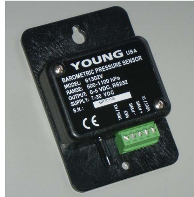
MODEL 61302V BAROMETRIC PRESSURE SENSOR