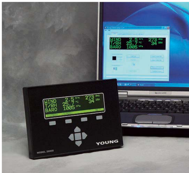
26800 Translator with PC setup program.

Channels 4 Solid State Switch outputs. Voltage/Current Each switch can handle 60VDC at 5A. Switched line must be referenced to ground.