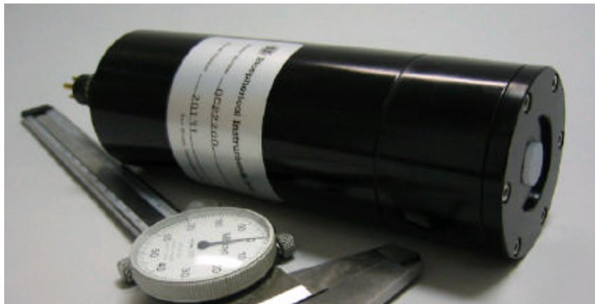
The QCP sensors are rugged and compact.

QCP-2300 , a logarithmic-analog output version is also available. This sensor was designed specifically for integration with 12-bit CTD systems and data loggers requiring a limited-range of signal input.