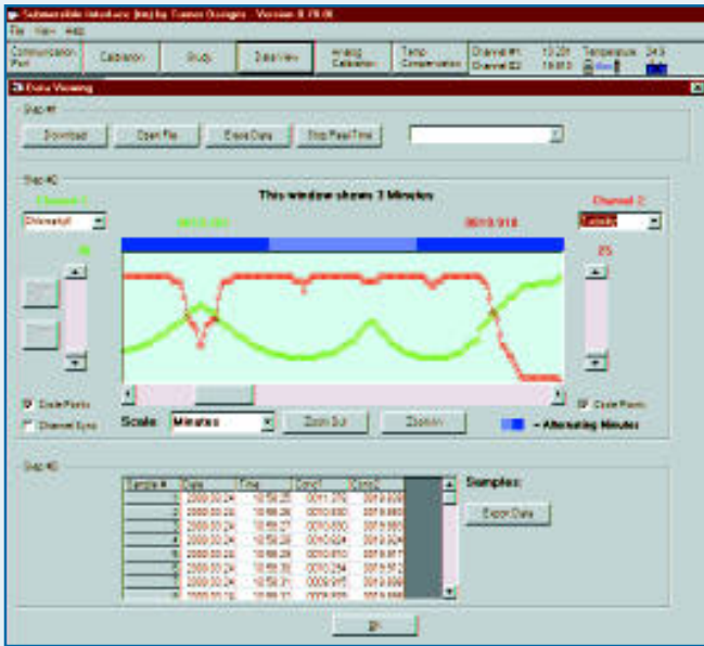
Figure 2. The Data View screen allows the user to download and view data from the internal data logger, as well as view data from real-time data transfer and saved files.