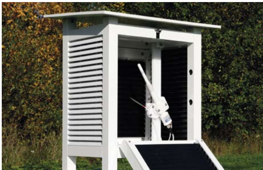
HMP155 with a new, stable HUMICAP®180R sensor and an additional temperature probe.