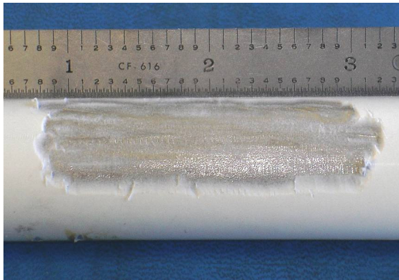
Coating scraped from frame part; damaged area approximately 2 inches (5 cm) long