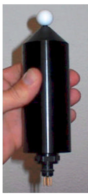
The new QSP-2000 is rugged and compact.

QSP-2300 , a logarithmic output version is also available. This sensor was designed specifically for integration with CTD systems and dataloggers requiring a limited-range of signal input.