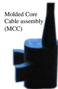
Molded Core Cable assembly (MCC)