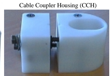
Cable Coupler Housing (CCH)

The Inductive Cable Coupler consists of two parts that are sold separately: the Molded Core Cable assembly (MCC) and the plastic clamp-on Cable Coupler Housing (CCH). The MCC is housed within the CCH, which makes it possible to replace the MCC if desired.